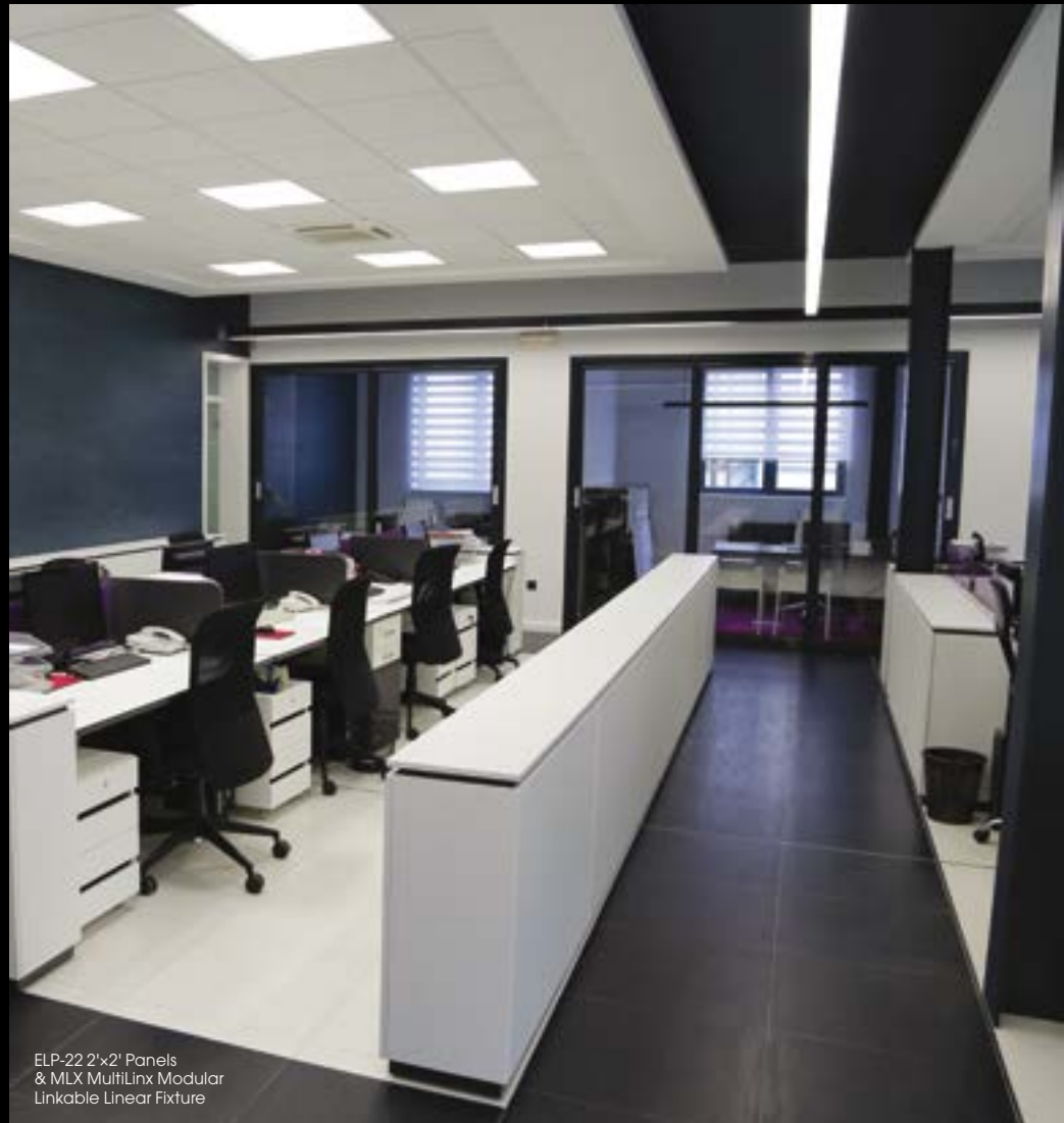
ELP-22 2'x2' Panels & MLX MultiLinX Modular Linkable Linear Fixture