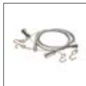
ELP-22-SCK 2'x2' Suspension Cable Kit Includes Aircraft Cables and hardware. Requires assembly.