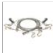
ELP-24-SCK 1'x4' and 2'x4' Suspension Cable Kit Includes Aircraft Cables and hardware. Requires assembly.