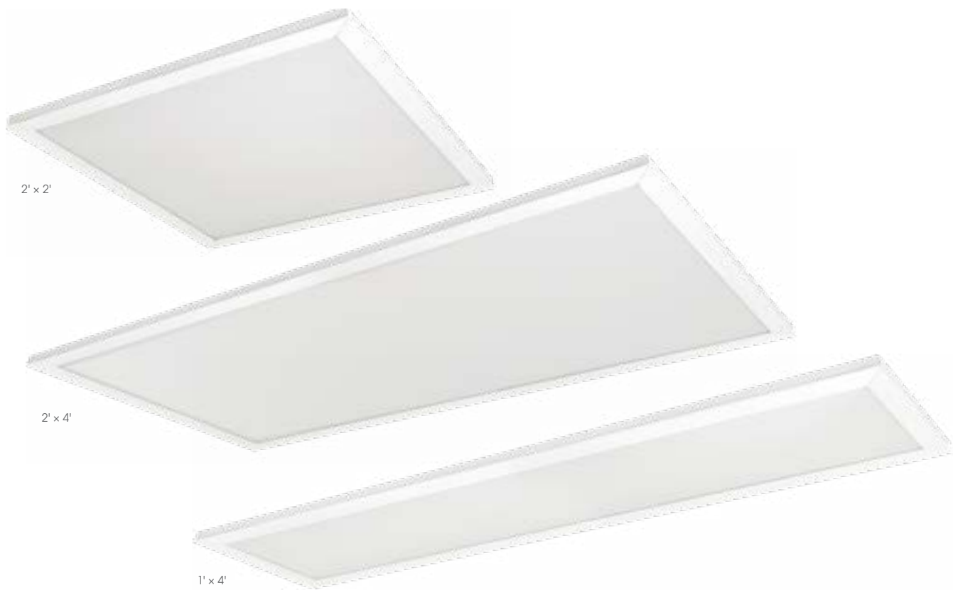
JESCO Lighting Port Washington Customer Service Area