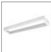
ELP-14-SMK 1' x 4' Surface Mount Kit Includes 4 Side Panels and hardware. Requires assembly.