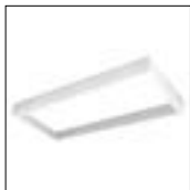
ELP-24-SMK 2' x 4' Surface Mount Kit Includes 4 Side Panels and hardware. Requires assembly.